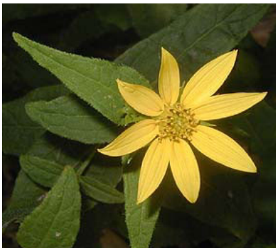
Woodland Sunflower ( Helianthus divaricatus )

you're a North Branch Wild Gardener and have plants that are six or more years old, he will arrange to get them from you and hold them until ready to go into the VRC grounds.