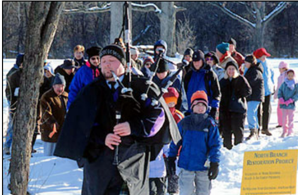
The Bagpiper leads the procession to the bonfire.