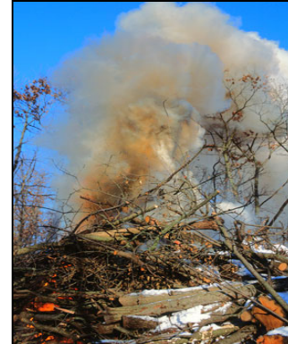
The bonfire goes up in smoke.

North Branch Restoration Project P.O. Box 2154 Northbrook, IL 60062-3707