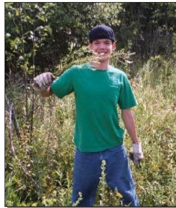
The Berg boys pull white sweet clover.