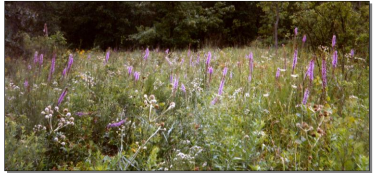
Blazing star field