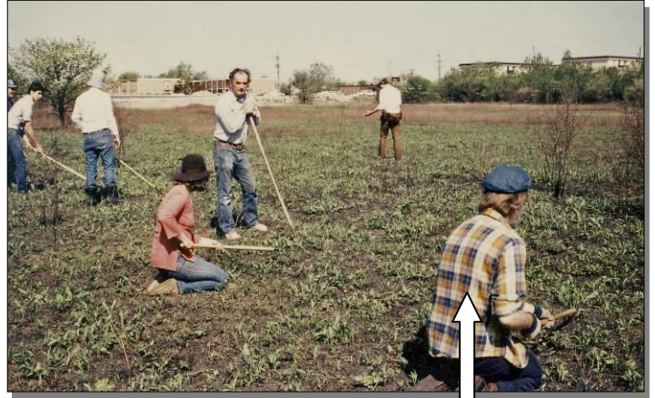
Duke, Spring 1982, Miami Woods Prairie