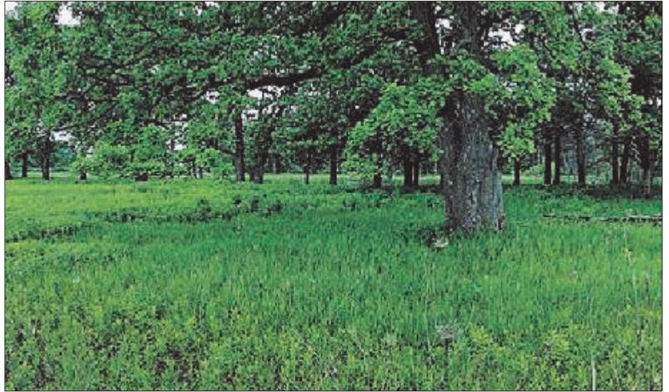
Middlefork Savanna, Lake County Forest Preserve