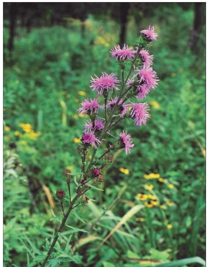
Savanna blazing star blooming on the North Branch.

Long term we hope to recruit volunteers to monitor all known populations of threatened and endangered plants along the North Branch. We believe that maintaining and increasing our rare plant populations is one of the measures of suc-