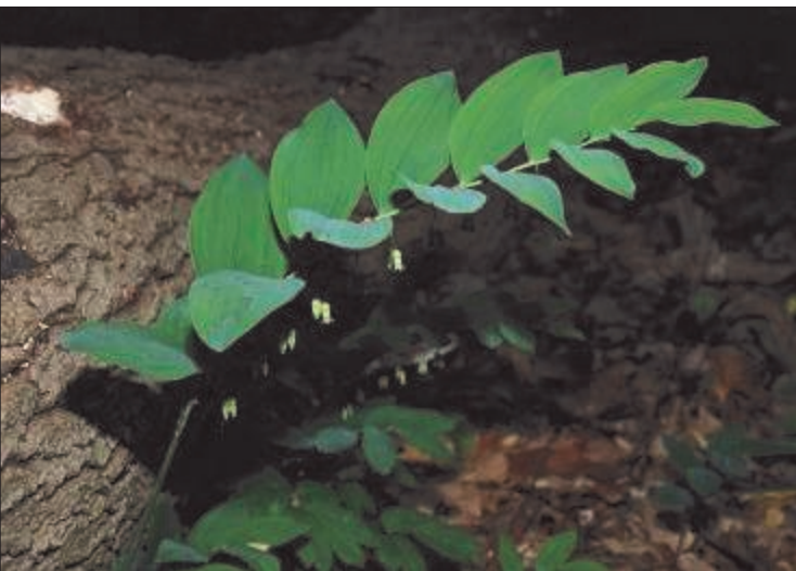
downy Solomon's seal

Extensive natural resource restoration activities have taken place since the mid-1980s, making