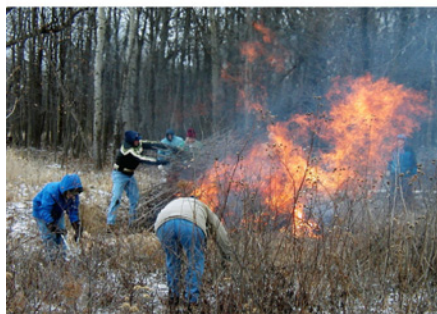
Hot, Hot, Hot